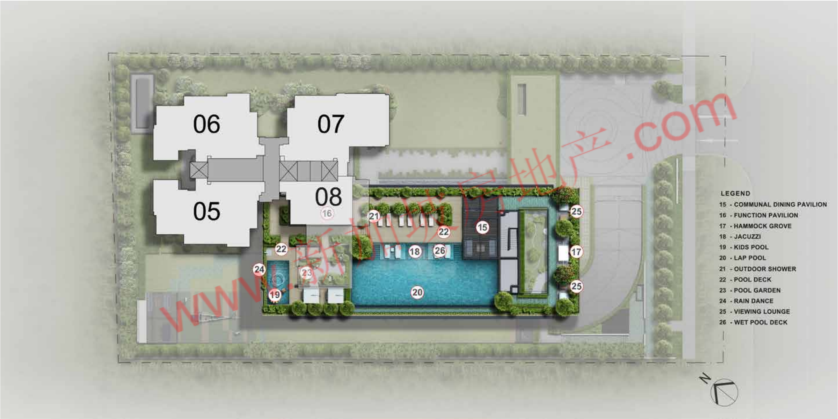
Site Plan - Level 4