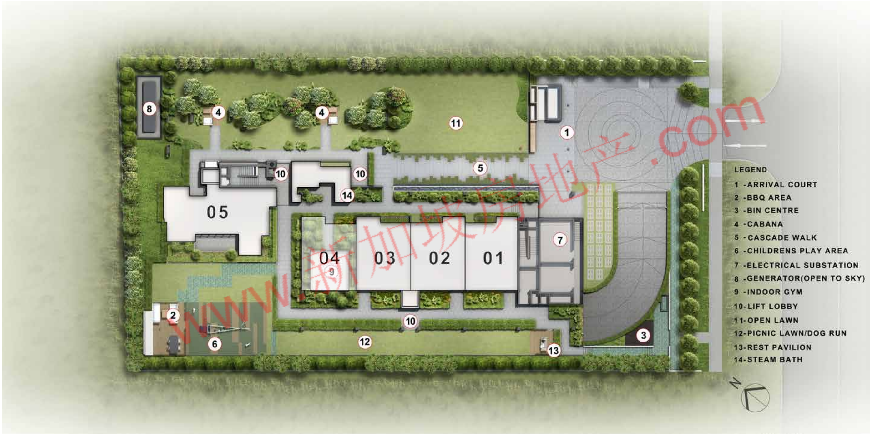
Site Plan - Level 1